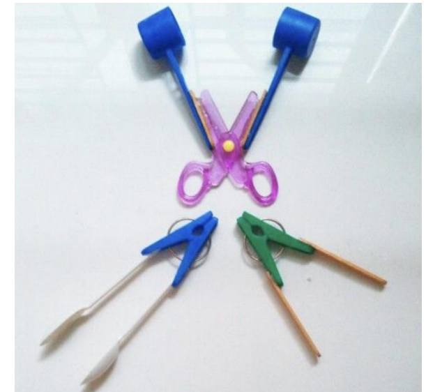
Clothes peg tweezers