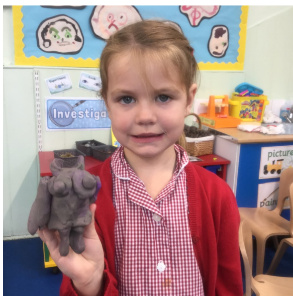
Modelling a owls from clay.