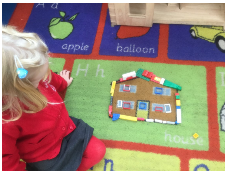
Learning about shape.