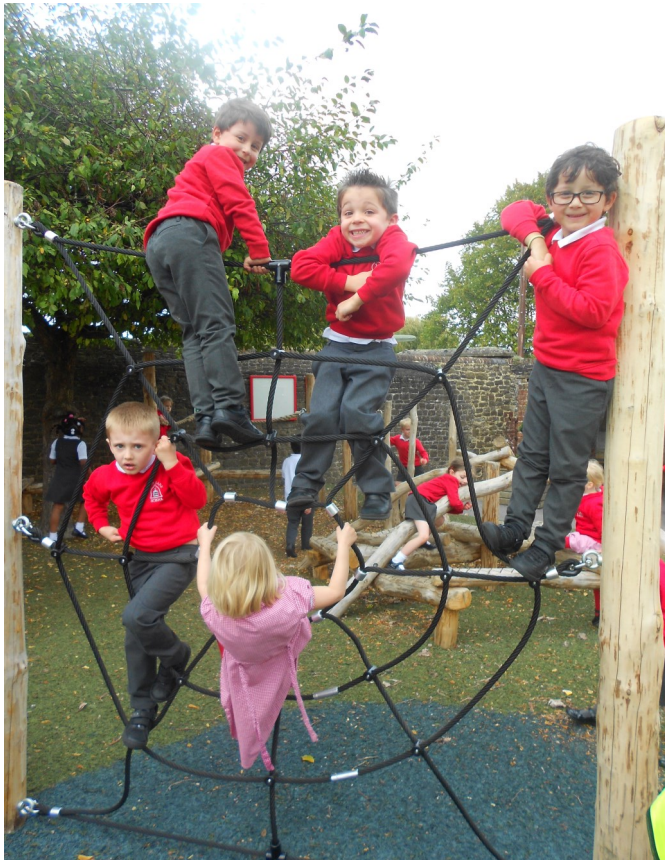
Children enjoying the new playground and developing their gross motor skills.