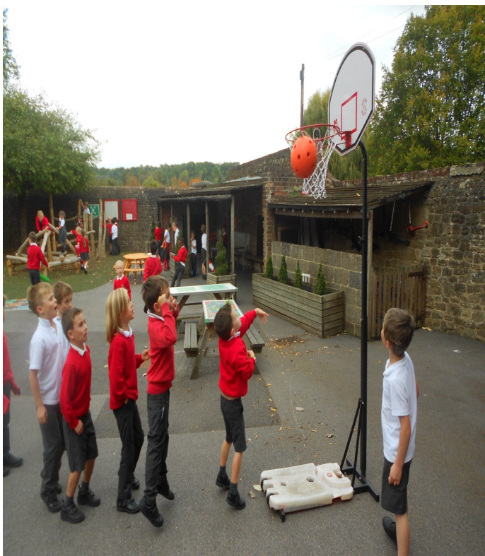
Boys developing their accuracy at throwing using the new netball goals .