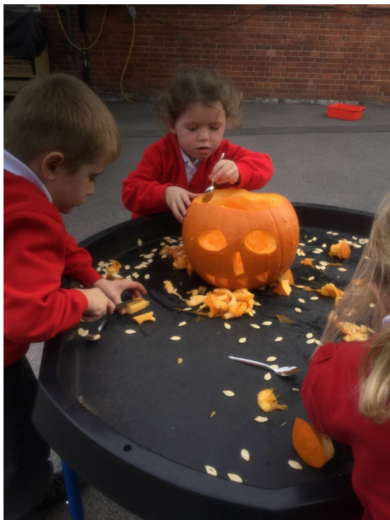
Year R carving and exploring pumpkins.