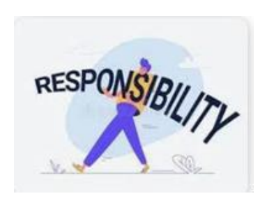
Our Value for this half-term is Responsibility.